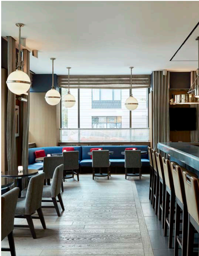
Clockwise: guest suite, The Regency Bar & Grill, The Regency Bar & Grill private dining room