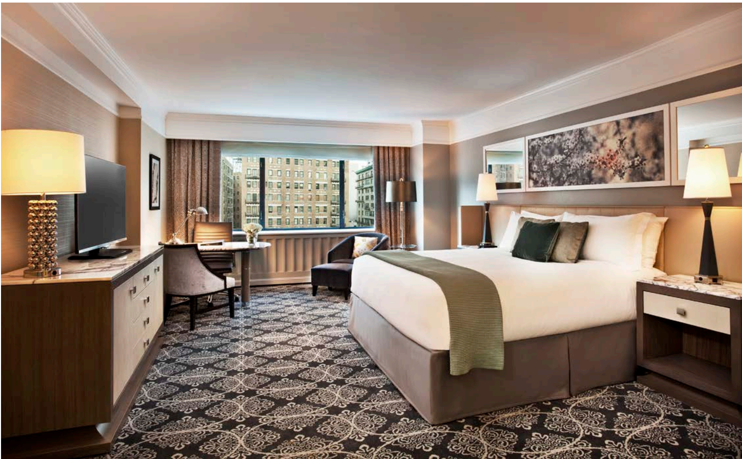
Top: meeting room Bottom: guestroom