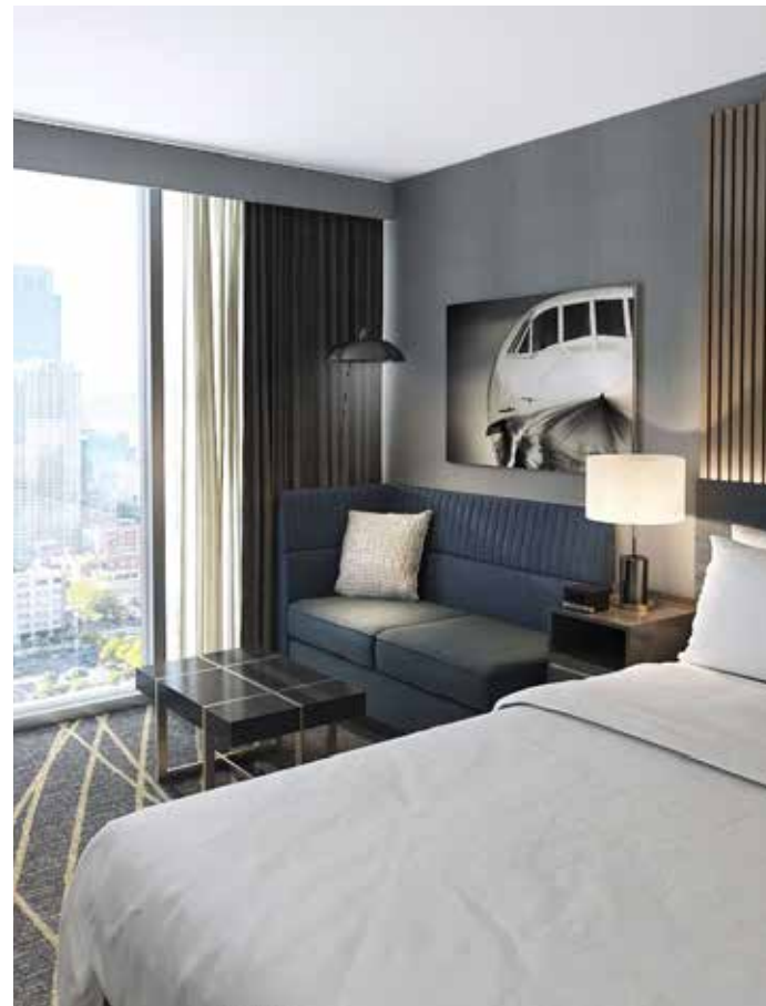
Clockwise from top: City Beautiful Ballroom banquet set, king guestroom, exterior