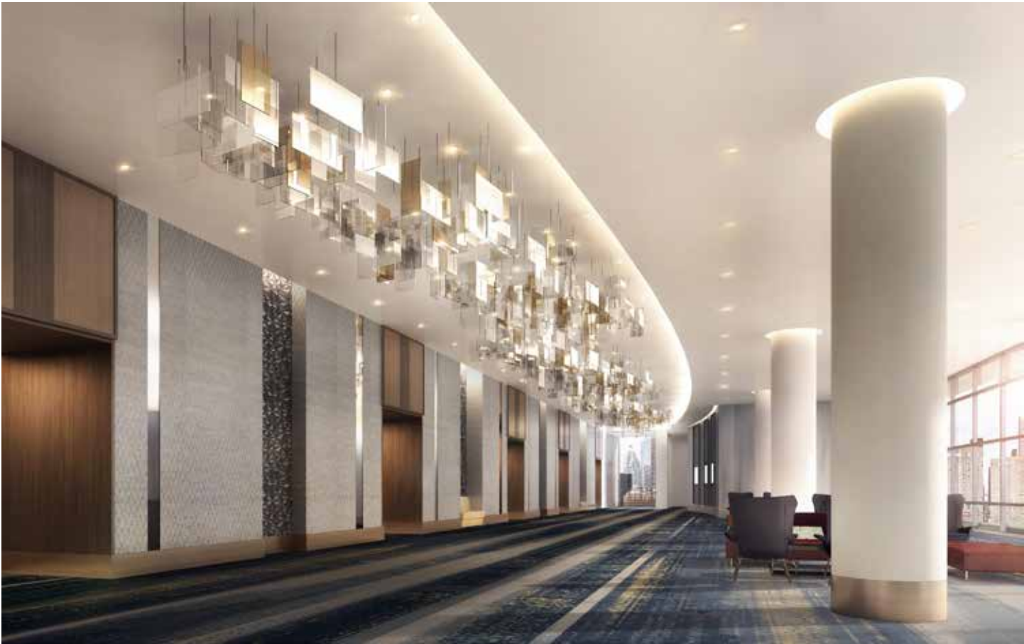
From top: terrace, City Beautiful Ballroom prefunction