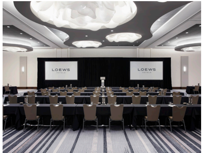
From left: Teylers Meeting Room, Avedon/Cassatt Ballroom