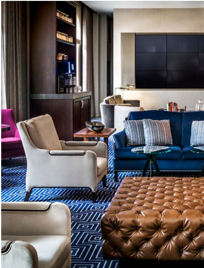
Clockwise from top left: private dining at Precinct Kitchen + Bar, Apothecary Lounge, guestroom