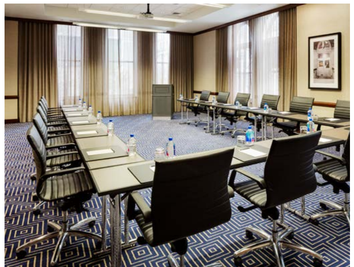
From left: Taylor Room, Crowley Room