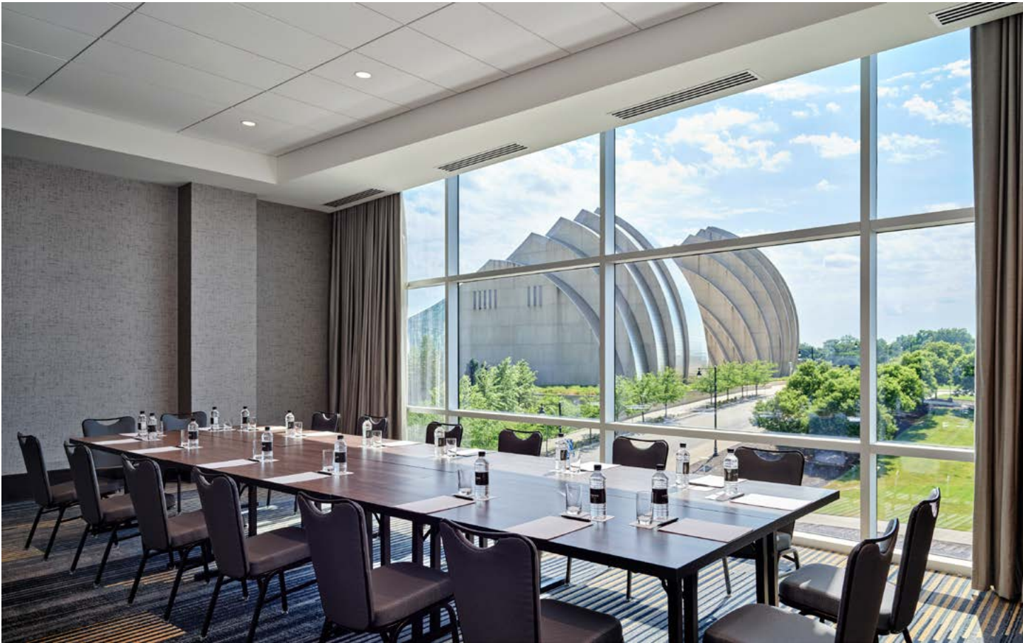
From top: Neptune Ballroom, Brush Creek meeting room