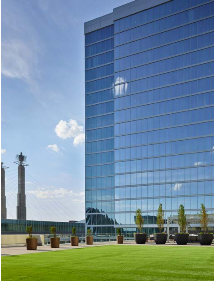
Clockwise from top: City Beautiful Ballroom, Event Lawn, King guest room