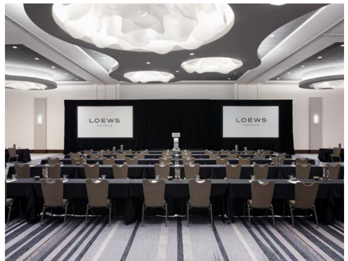
From left: Warhol Room, Avedon/Cassatt Ballroom