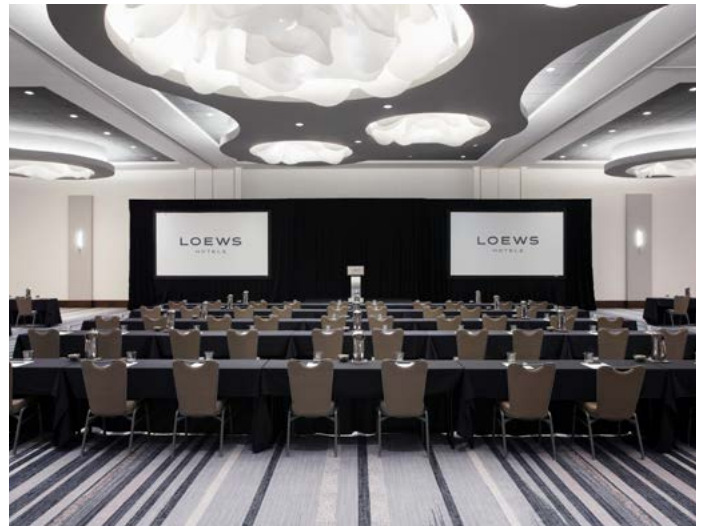
From left: Warhol Room, Avedon/Cassatt Ballroom