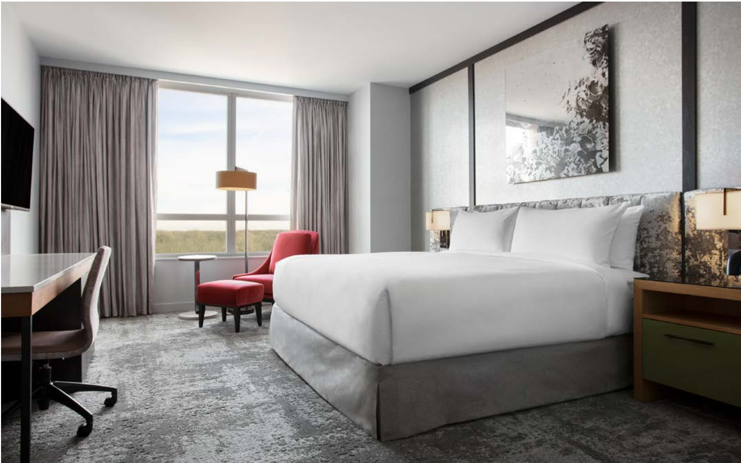
Top to bottom: Lobby, Deluxe Room