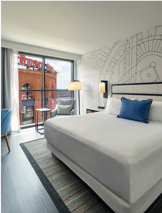
Clockwise from top: Cardinals Ballroom, guest room, lobby