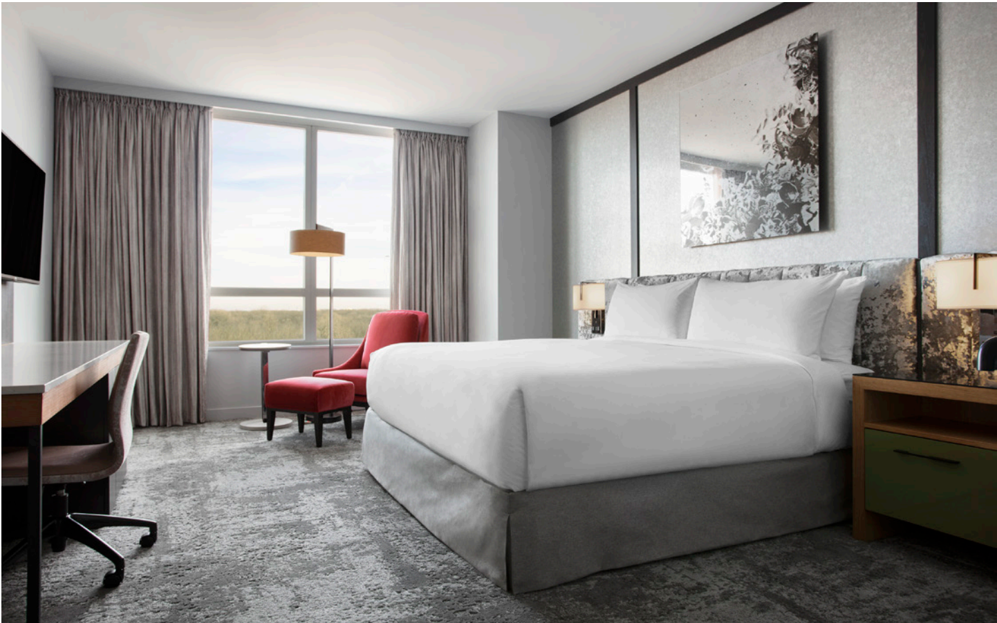
Top to bottom: Lobby, Deluxe Room