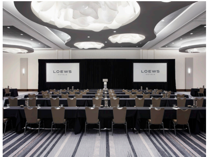
From left: Warhol Room, Avedon/Cassatt Ballroom