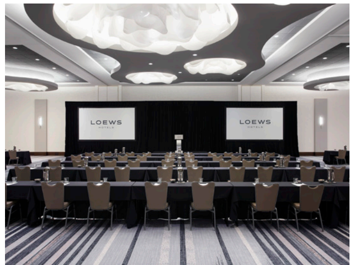
From left: Warhol Room, Avedon/Cassatt Ballroom