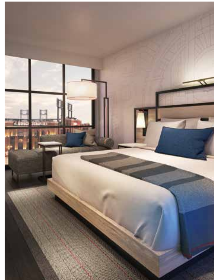
Clockwise from top: Ballpark Village, guest room, lobby